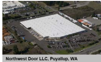
Northwest Door LLC, Puyallup, WA

Hörmann Northwest Door, LLC 19000 Canyon Road East, Puyallup, WA 98375-9746 Phone: 253-375-0700 Fax: 253-375-0800 Email: info@northwestdoor.com www.northwestdoor.com