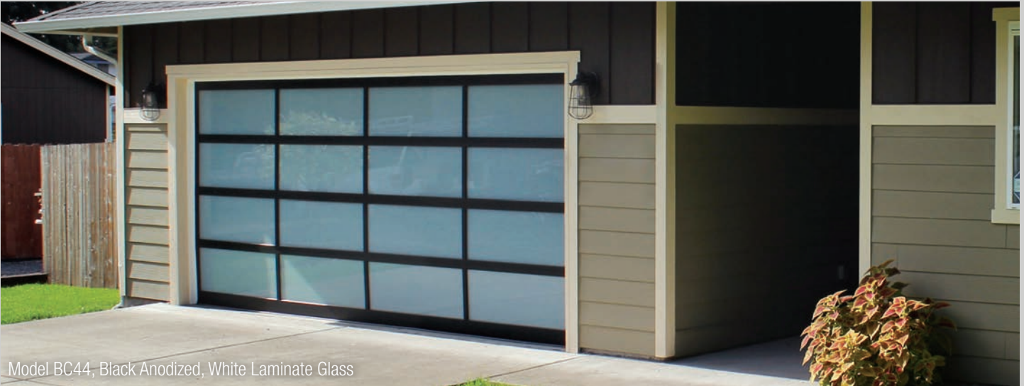
Model BC44, Black Anodized, White Laminate Glass

According to Remodeling Magazine's Cost vs. Value Annual Report , year after year, a garage door replacement with upscale garage doors has continued to be one of the highest ROIs ( Return on Investment ) of all exterior remodeling projects.