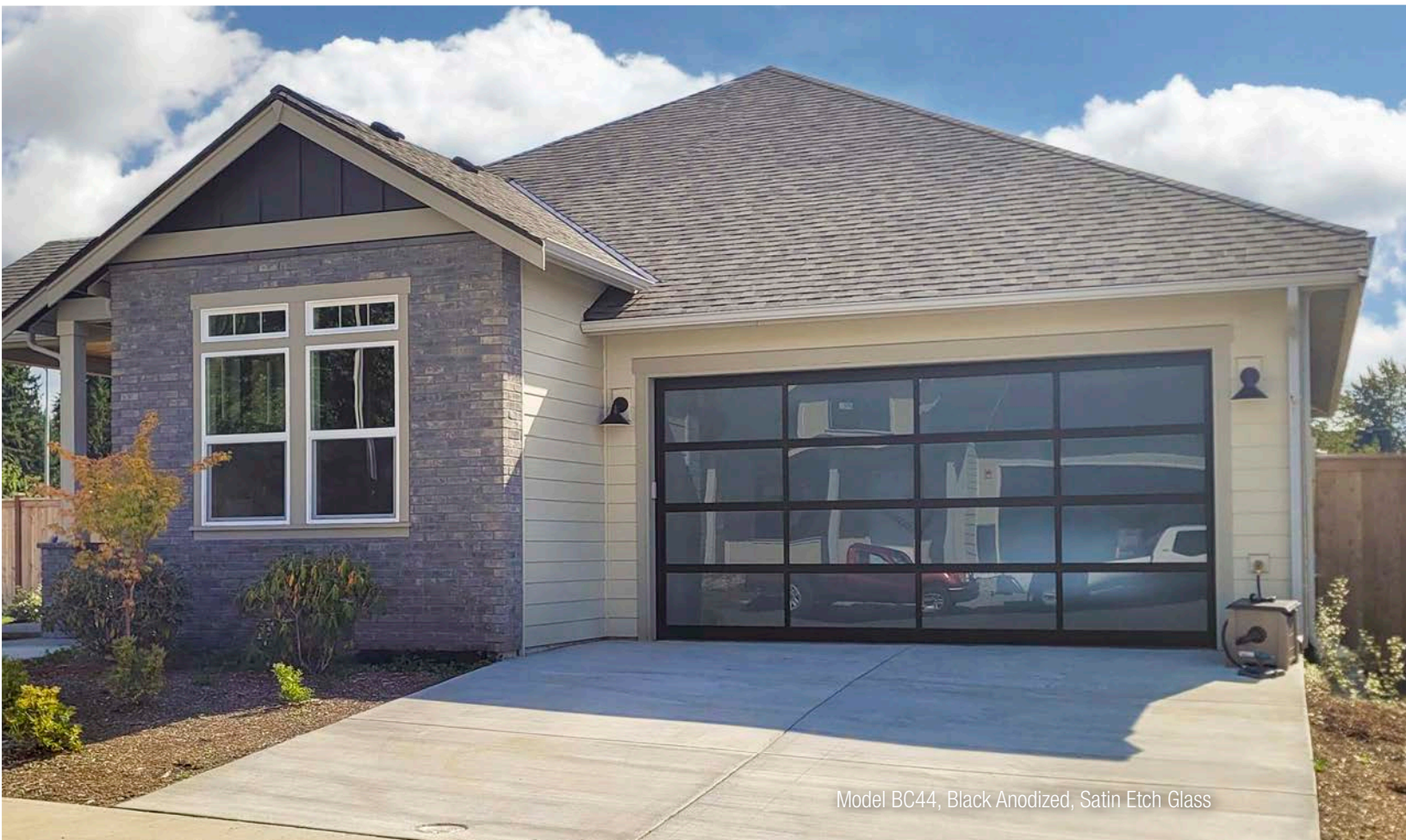
Model BC44, Black Anodized, Satin Etch Glass