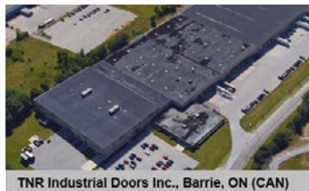
TNR Industrial Doors Inc., Barrie, ON (CAN)