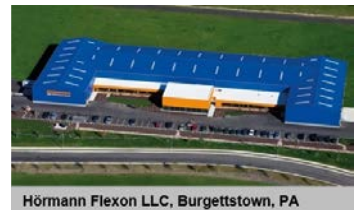
Hörmann Flexon LLC, Burgettstown, PA