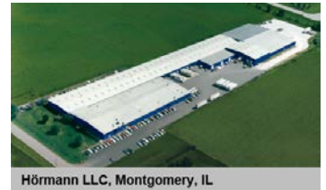
Hörmann LLC, Montgomery, IL