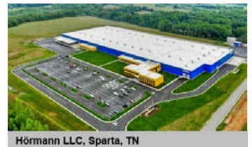
Hörmann LLC, Sparta, TN