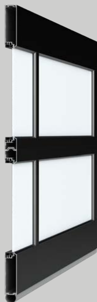
Black Anodized with White Laminate Glass