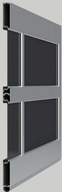
Clear Anodized with Black Laminate Glass

The full vision design of the Builder Classic makes it aesthetically pleasing and suitable for many exterior and interior applications including offices, restaurants, she sheds and man caves.